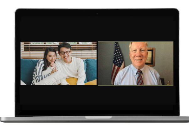
Couple and clerk attend virtual video conference